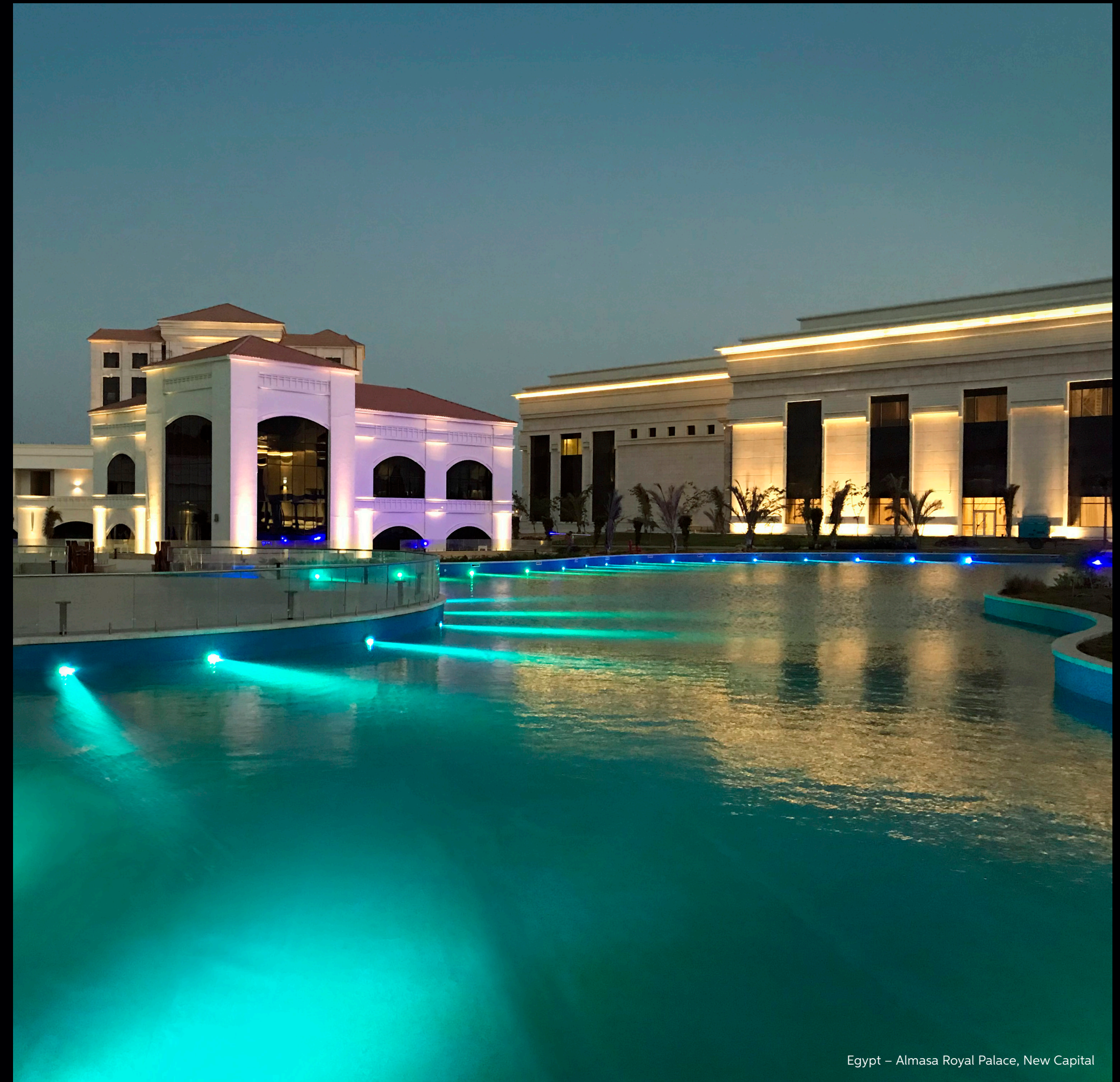
Egypt – Almasa Royal Palace, New Capital